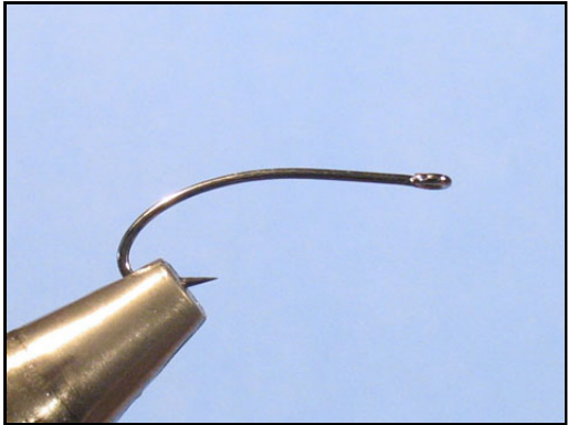
Mount a hook in the vise.