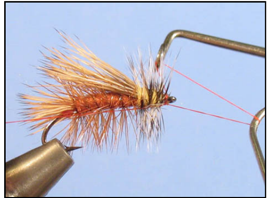
Make a whip-finish, cut the thread and...