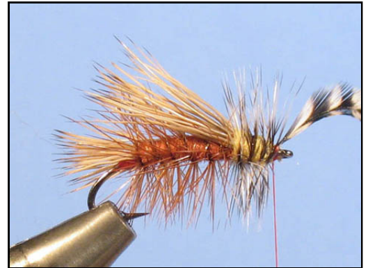
Spiral wrap the hackle over the dubbing and tie it down in front of it. Cut the waste.