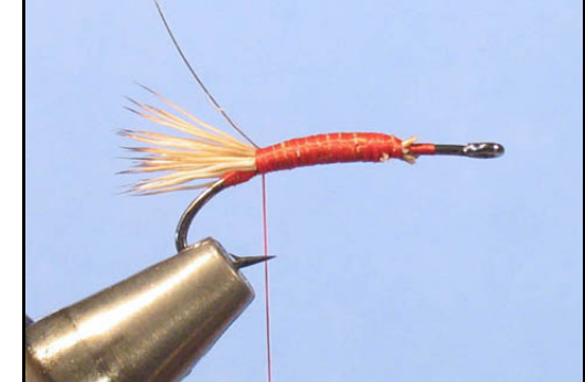
Cover the butts and tie in a piece of thin wire. Wrap the thread back to the tail.