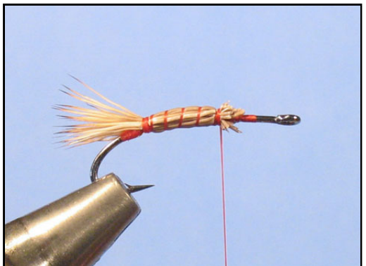
Cut the waste with angled cuts so that it won't result in a sharp edge when you cover the hair butts.