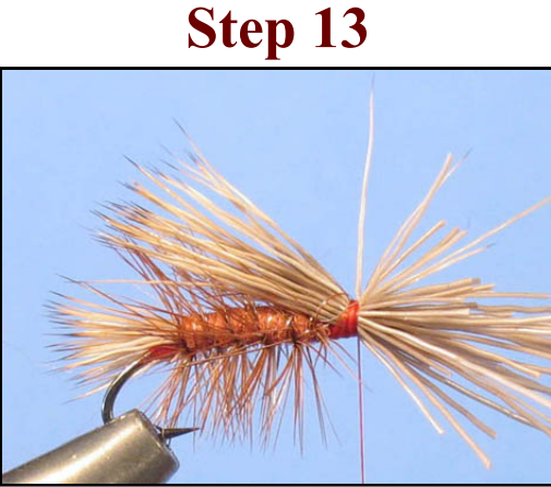
Stack and clean a clump of elk hair for the wing. The tips should reach back to half the tail. Tie it down right in front of the abdomen and let the hair butts spread around the hook. This will secure them better.