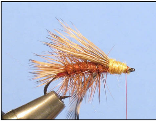
Wrap the dubbing up to the hook eye.