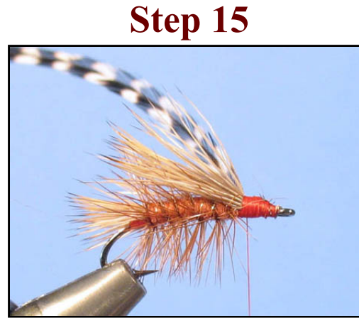
Tie in a grizzly rooster hackle by the wing base.