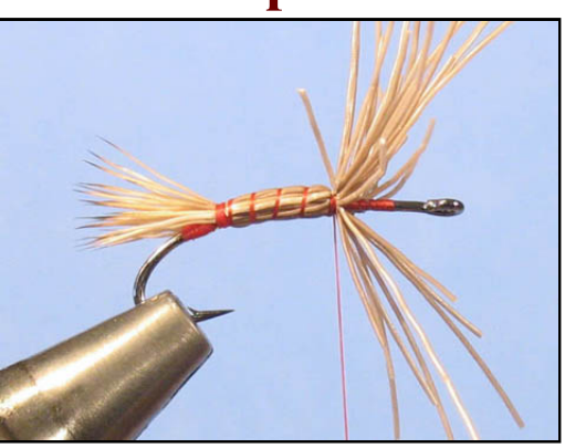
Spread the surplus around the hook while you tie it down along the hook shank. Stop at the point where the thorax will start.