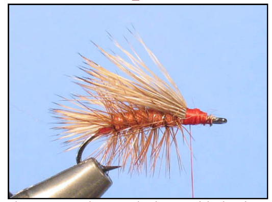
Cut the waste and cover the butts with the thread.