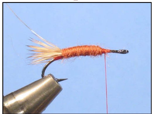
Make a slim body with the dubbed thread.