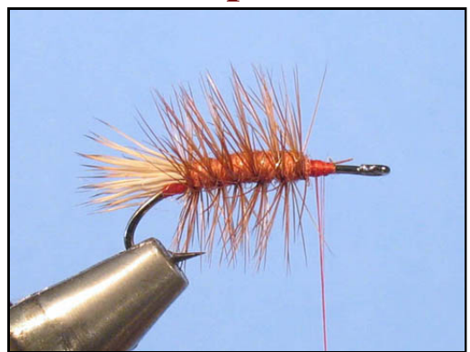
Tie off the wire in front of the abdomen.