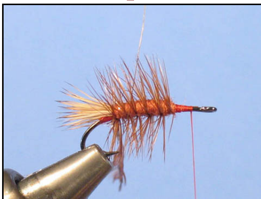
Tie down hackle using the wire. Spiral wrap the wire up the body through the hackle and wiggle it from side to side to avoid tying down too many hackle barbs.