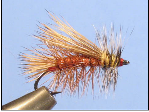
... there you have it. An extremely popular fly, which can represent both hoppers, stoneflies and caddis.