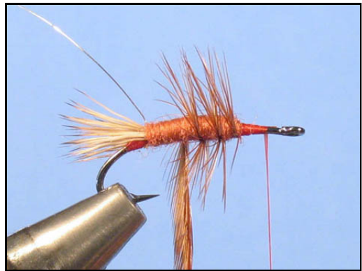
Palmer the hackle backwards.