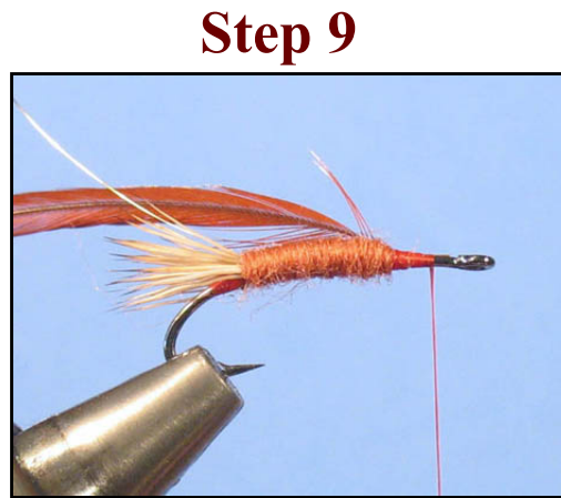
Tie in a brown rooster hackle.