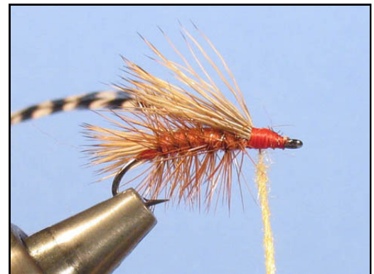
Dub the thread, again carefully, with a dubbing of choice.