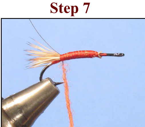
Dub the thread with a dubbing of choice. Take it easy with the dubbing. With the underbody we already have, it's easy to go too far.