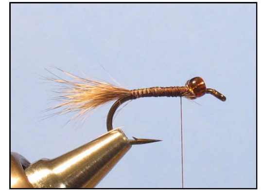
Tie in a tail using guardhairs from the cheek area of the hare's mask. Tie down the waste all the way up to the eyes.