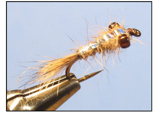
This is designed to be fished close to the surface and that's why no weight is used. The flashback will reflect the light coming from above the water. These reflections will in turn bounce back down from the surface, right above the fly. This will attract attention and tell the fish that "this isn't 'just another nymph' coming drifting... this one's coming with a halo".