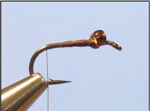
Wrap the thread back to the bend.