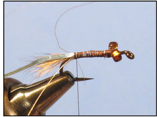
Tie down all three back to the bend.