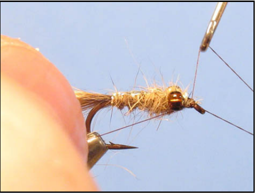
Make a whip-finish and cut the thread.