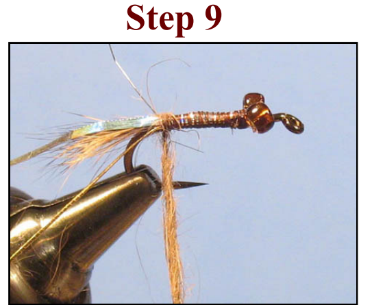
Dub the thread with underfur from the mask's cheeks.