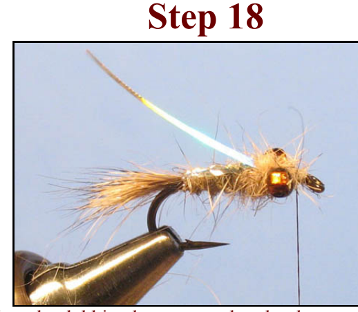
Wrap the dubbing between and under the eyes to form a head. Let the thread hang in front of the eyes.