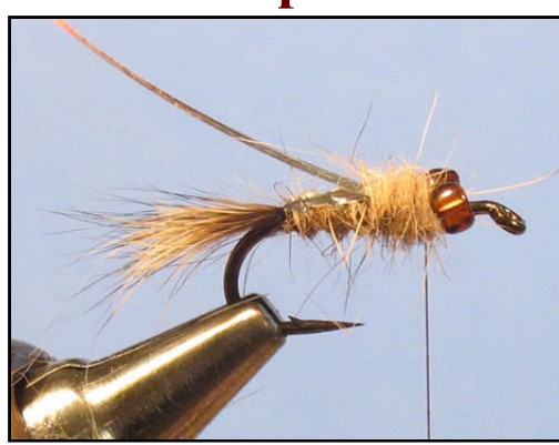
Dub the thread and build up a thorax.