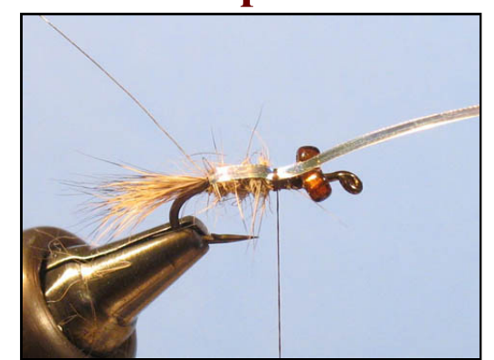
Fold the mylar tinsel up on top of the body and tie it down with a couple of wraps immediately in front of it. Do NOT cut the waste.