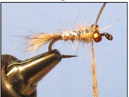
Dub the thread one last time.