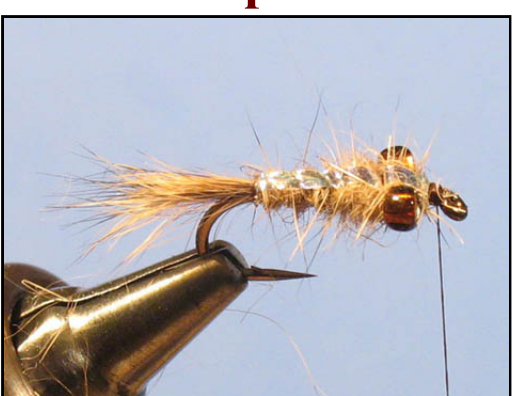
Fold the mylar tinsel over the head and tie it down behind the hook eye. Now you can cut the waste.