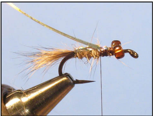
Fold the mylar tinsel backwards over itself and make a couple of wraps just in front of the abdomen.