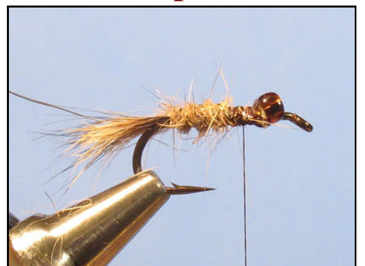
Rib the body with the oval tinsel, counter clockwise for additional durability. Tie down the tinsel and cut the waste.