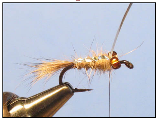
Fold the mylar tinsel over the thorax and tie it down with the thread just behind the eyes. Do NOT cut the waste.