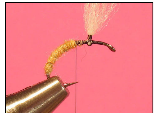
Wrap the dubbing up to where the thorax is supposed to start.