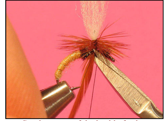
Cut the waste of the hackle feather.