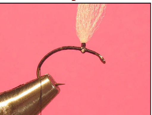
Make another couple of figure-8 wraps to secure the wing better and fold then up the ends and post them together on top of the hook. Wrap the thread down the hook to the point you want the abdomen to start.