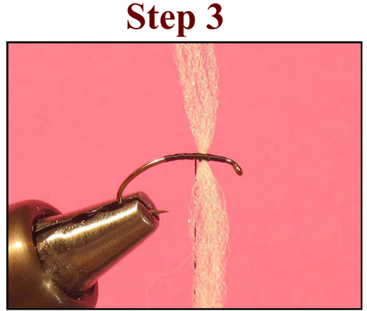
Before securing it with more and tighter wraps, twist it around the hook so it ends up under it.