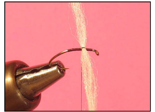
Tie in a piece of poly yarn, perpendicular to the hook shank, with a couple of figure-8 wraps.