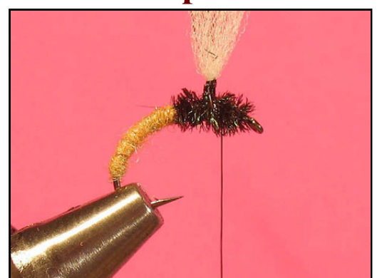
Make a few wraps up and down the post to give a good base for the hackle wrapping coming up. Leave the thread hanging in front of the wing and on the near side of the hook.