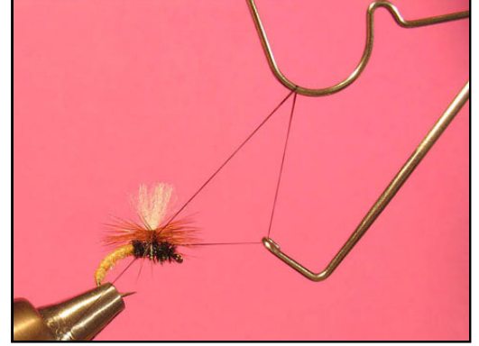
Take out the bottle of head cement and open it. Then make a 2-turns whip-finish around the wing post... but do not finish off just yet.