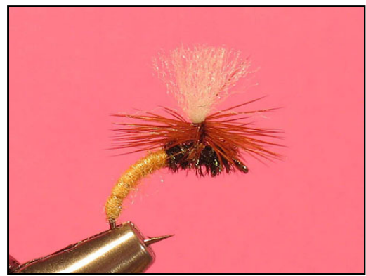
... and ready to be fished.