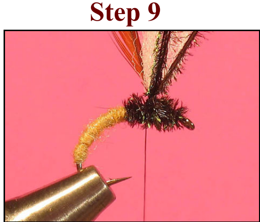
Wrap the herls together with the thread and make your thorax. Tie the herls to the post and cut the waste.

Tie in 3-5 peacock herls at the back of the thorax area.