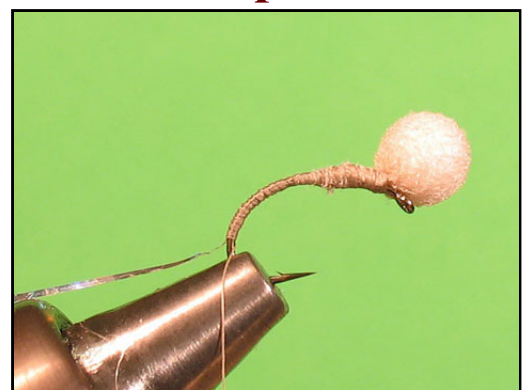
Tie in a piece of fine flat tinsel.