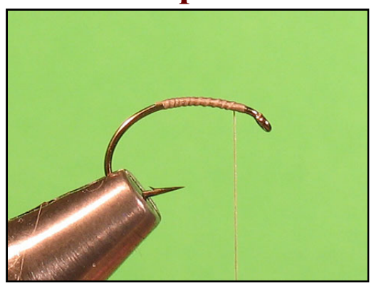
Cover the thorax area with thread.