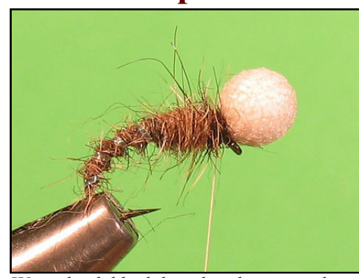
Wrap the dubbed thread to the suspender.