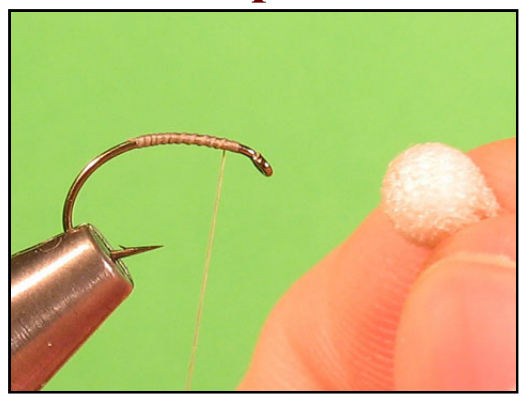
Fold the stocking piece to a little bag around the ball and stretch it.