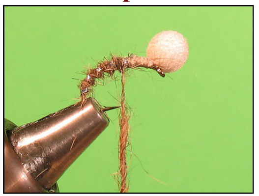
Dub the thread with hare's ear again, a little longer hairs this time.