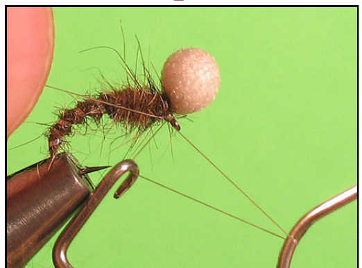
Make a whip-finish behind the hook eye.