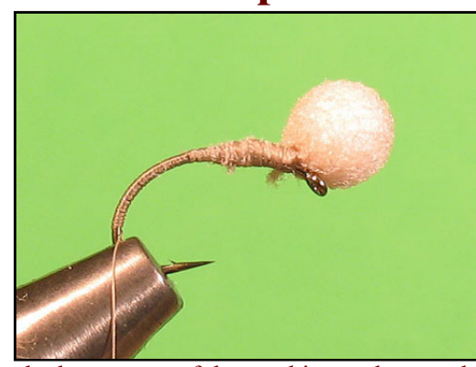
Cut the last excess of the stocking and cover the rest of the hook with thread.