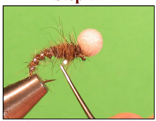
Finish the fly by picking out a little dubbing here and there between the tinsel wraps and some from the thorax for legs.