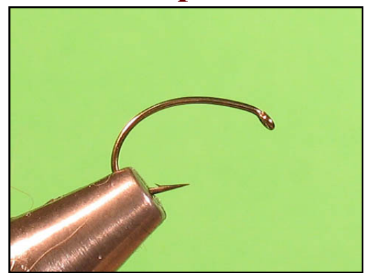
Mount a hook in the vise.