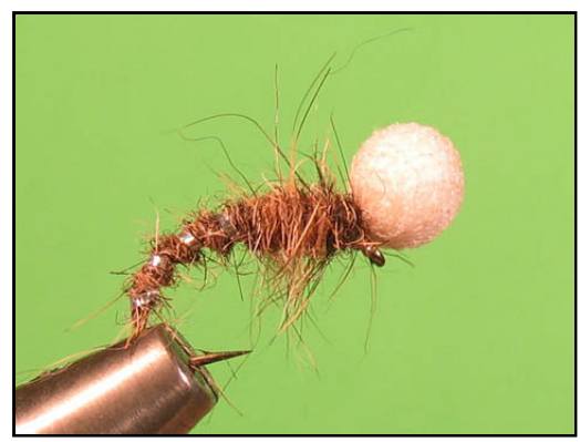
A simple fly that doesn't require lots of materials. Hare, tinsel, something floating and ladies underwear... stuff that we all have lying around somewhere.