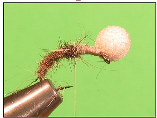
Wrap the dubbed thread up to the start of the thorax and stop there.