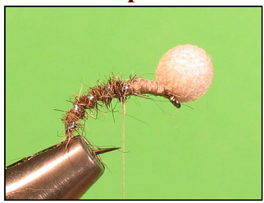
Rib the body with the tinsel, counter clockwise to secure the dubbing, and tie it down at the start of the thorax. Make the wraps rather tight.