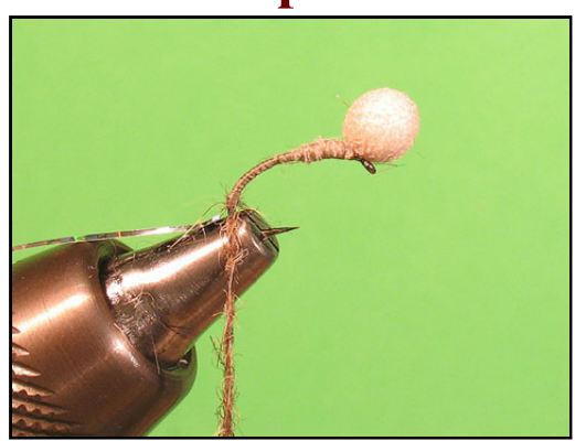
Dub the thread sparsely with hare's ear that's been cut a little shorter.